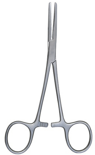
Rochester Pean SU-121-112