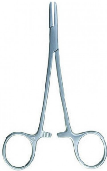
Webster Plain SU-126-101