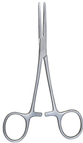
Rochester Pean SU-121-111